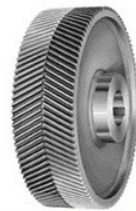
Double Helical Gear (Herringbone Gear)