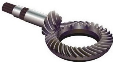
Spiral Bevel Gear