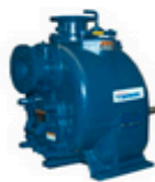
Self Priming Centrifugal