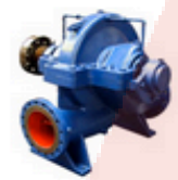
Horizontal Split Case