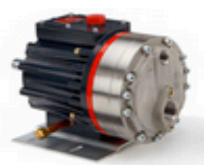
High Pressure Diaphragm