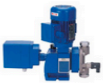
Metering/Dosing Reciprocating Plunger/Piston